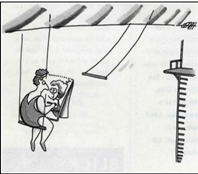
The Trapeze Artist...