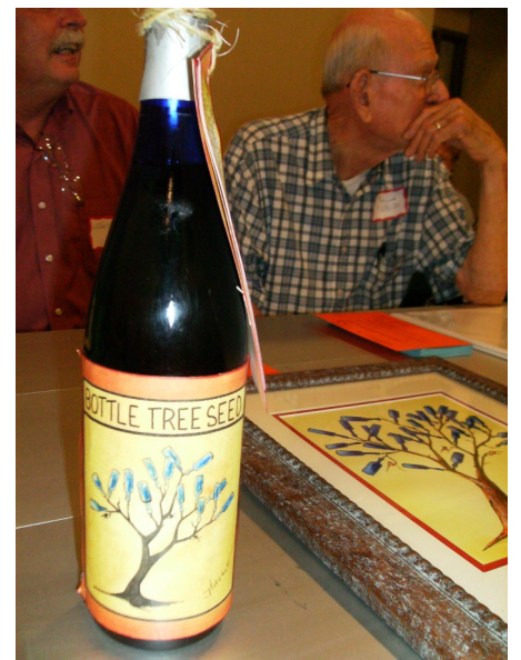
John's Bottle tree seeds