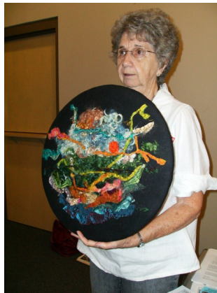
Ferrell's yarn art