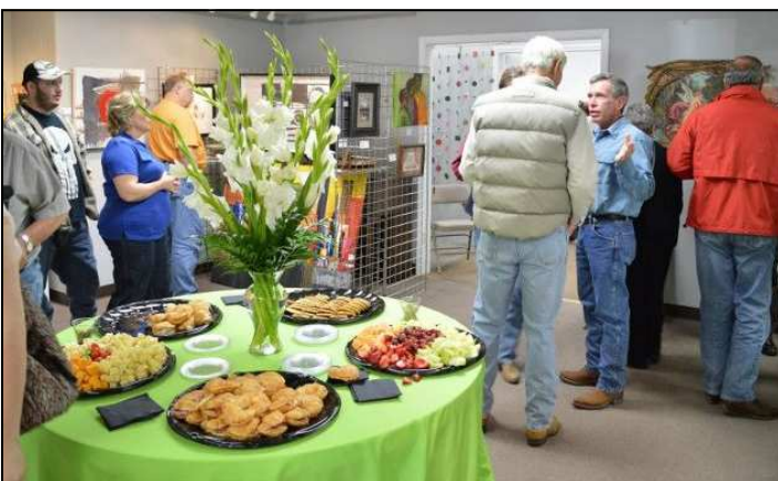
Photos below: Artists and locals mingle at the Sunrise Rotary Club's Art On Main held May 3.